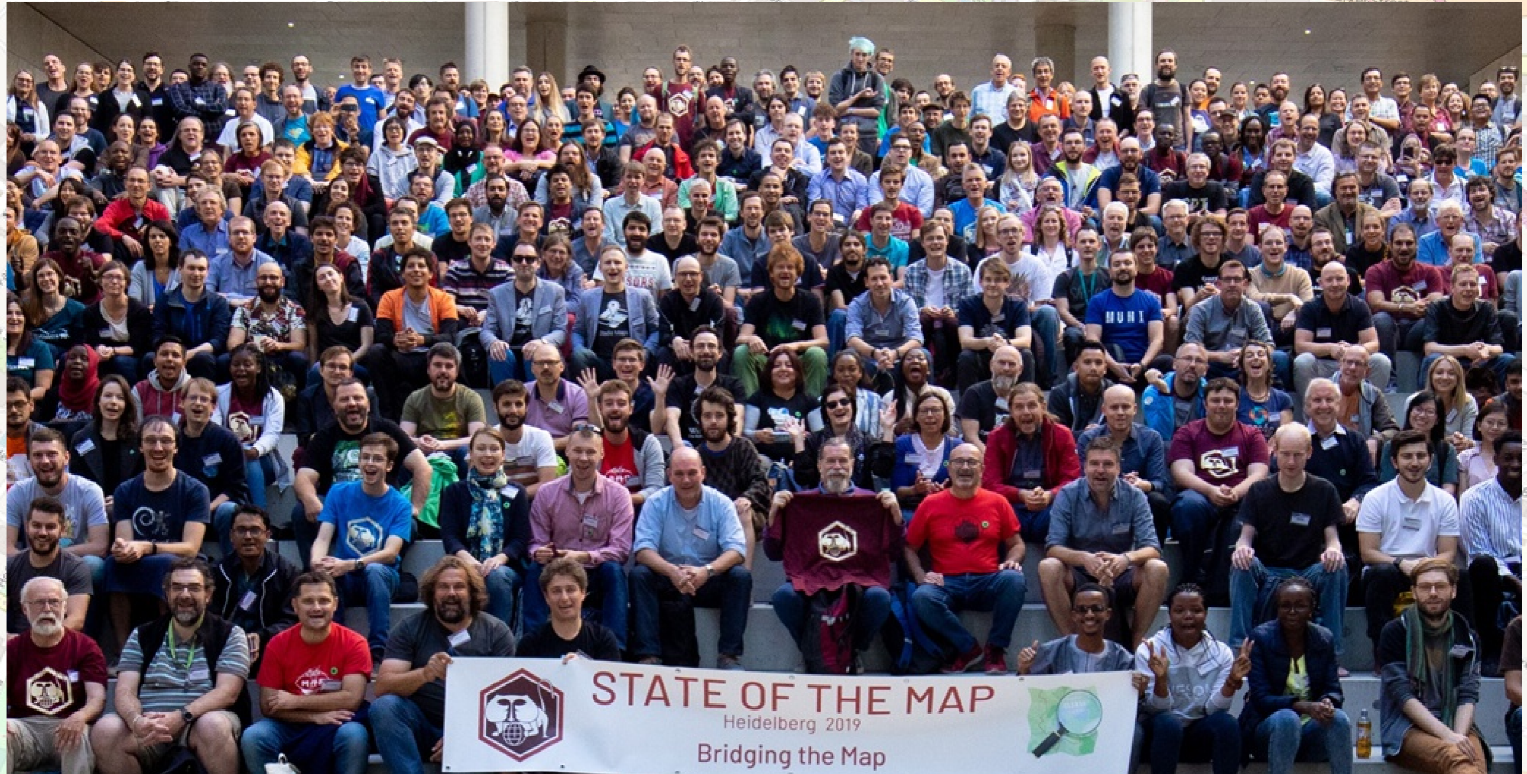
Group photo of the attendees at the 2019 State of the Map Conference.

The conferences also includes social events, cultural events and local tours that are included to promote networking and contact between delegates.