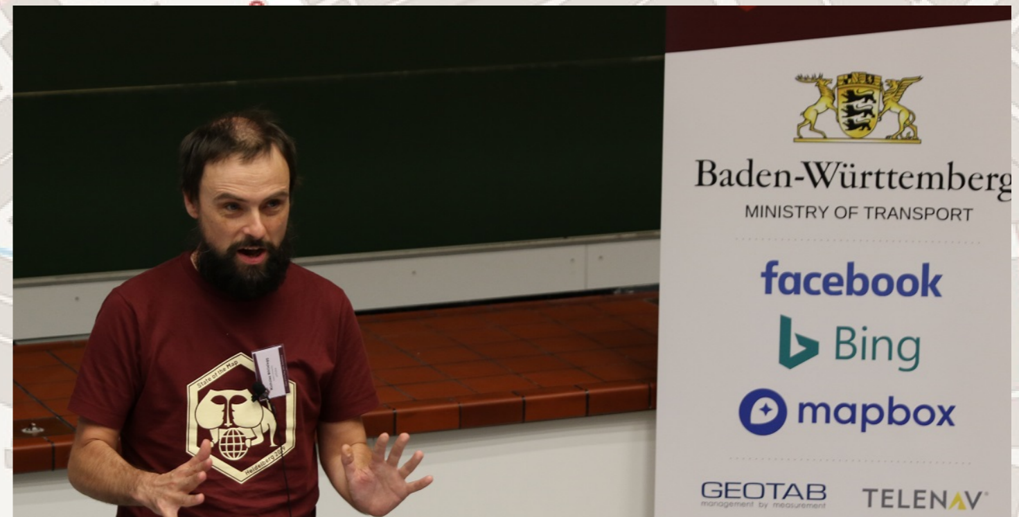
Prominent placement of sponsoring partner logos during lectures at the SotM Conference

The OpenStreetMap Foundation rotates the conference to a different venue every year. This year they will hold the SotM 2020 conference in Cape Town, South Africa, at the campus of the University of Cape Town. The conference will be held on 3 - 5 July 2020.